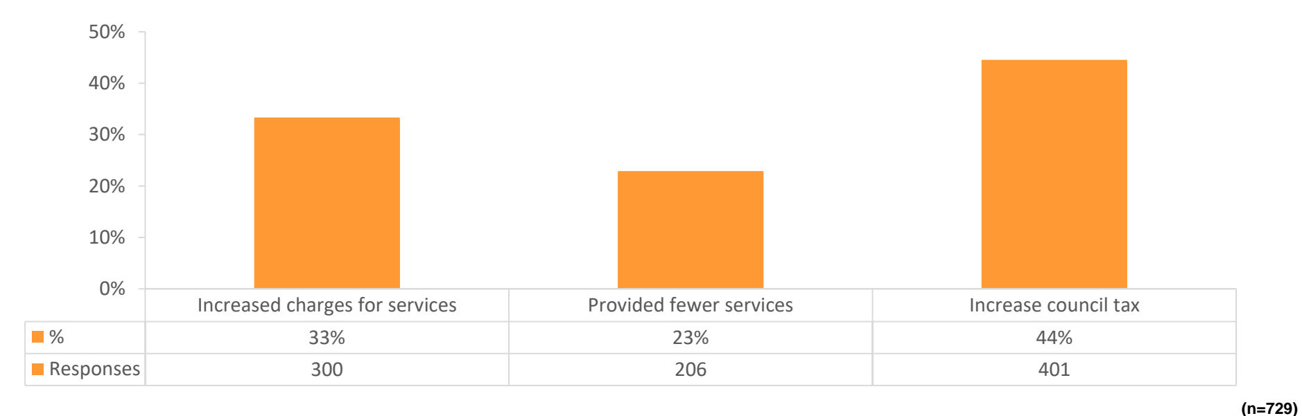
Do you support an increase in council tax to balance the budget and if so by how much?

To accelerate recovery and balance the budget, would you rather we; Please select all that apply